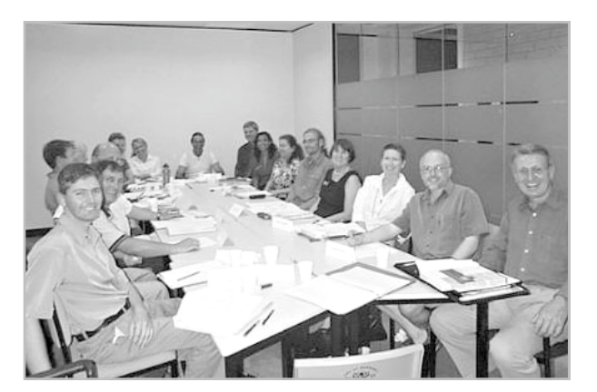
Sustainability advisory council

The stakeholders of the project were the staff of the City's Strategic and Corporate Planning Business Unit with direct input from community and major stakeholders within the City.